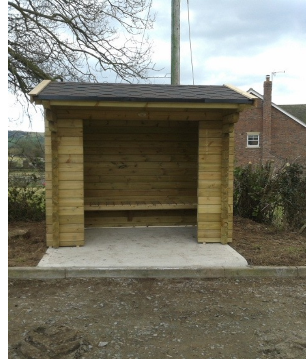
New bus shelter at Chorley